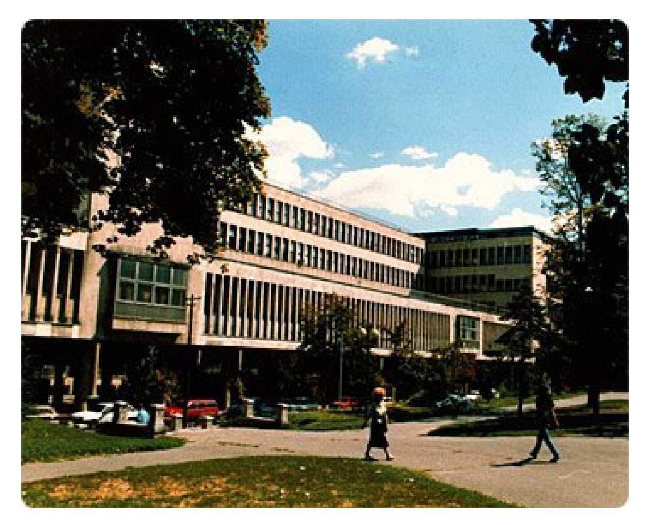
Conference Venue Faculty of Physical Chemistry, Studenski trg 12-14, Belgrade