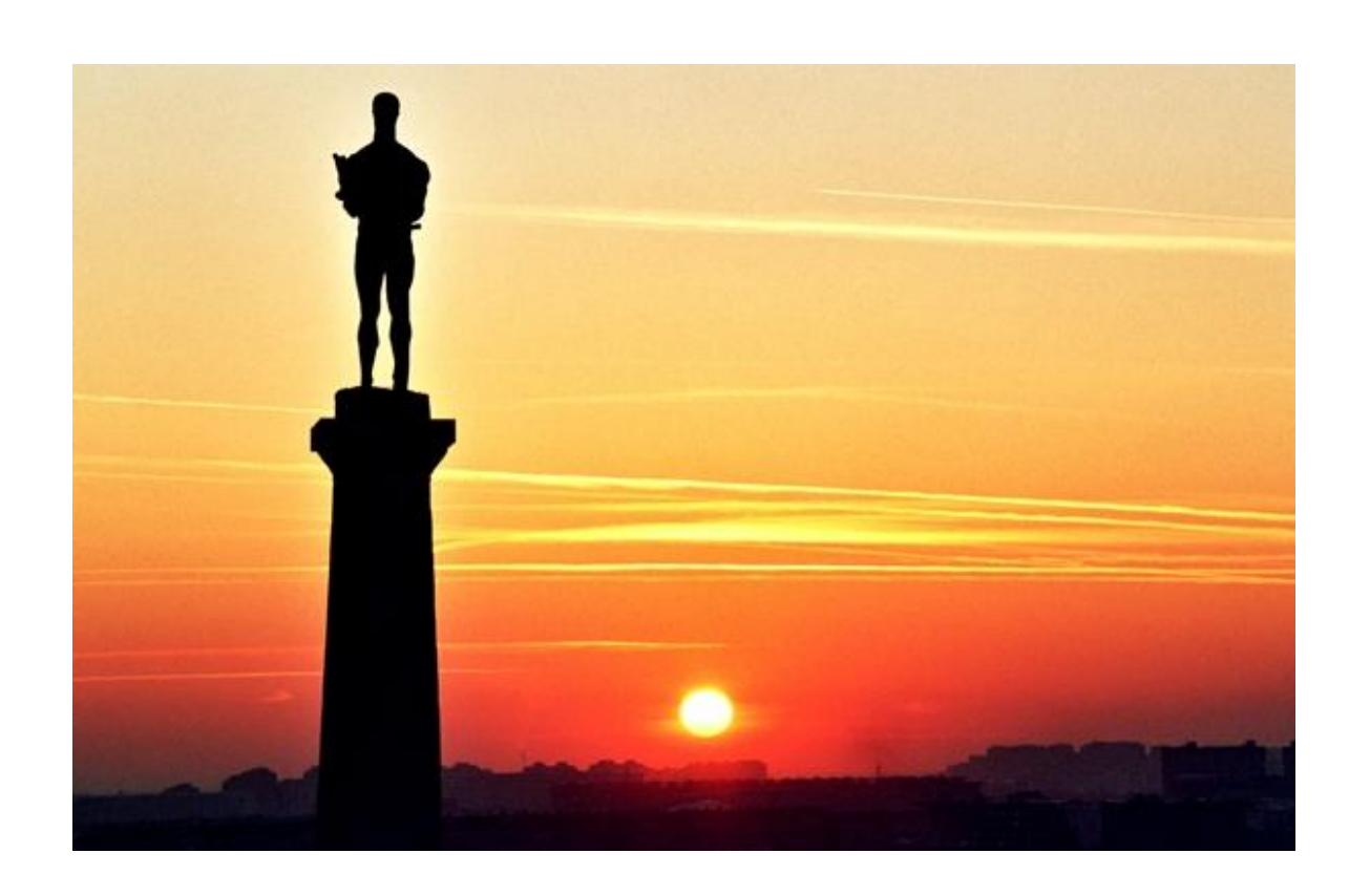
Dear colleagues, Welcome to Belgrade